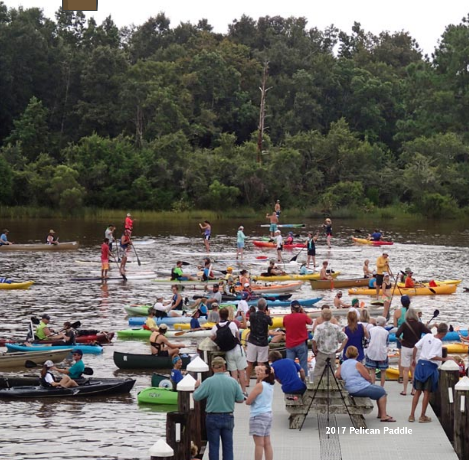
2017 Pelican Paddle

A quarterly publication - Weeks Bay Foundation Fall 2017 Volume 32, No. 3